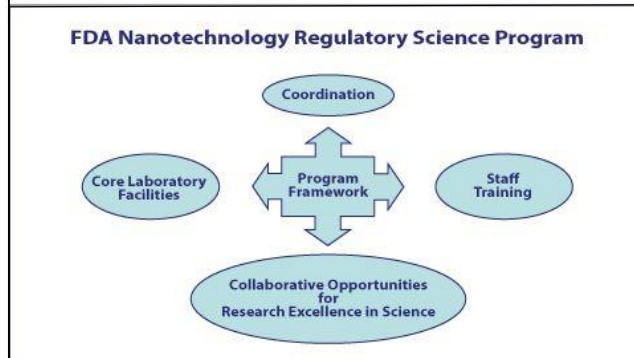
Figure 2. Nanotechnology Regulatory Science Research Plan Framework 11

Policy Options. Below is a list of policy options that are explored in this brief.